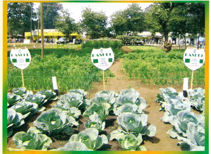
A demonstration plot of Cabbage Baraka F1 in Nane Nane Agricultural show, Arusha Tanzania