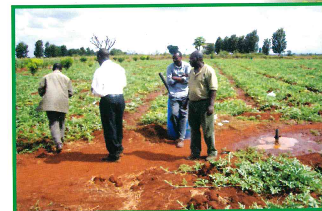
EASEED Sales Agronomist with watermelon sugarbaby (from EASEED ) farmers in Embu.