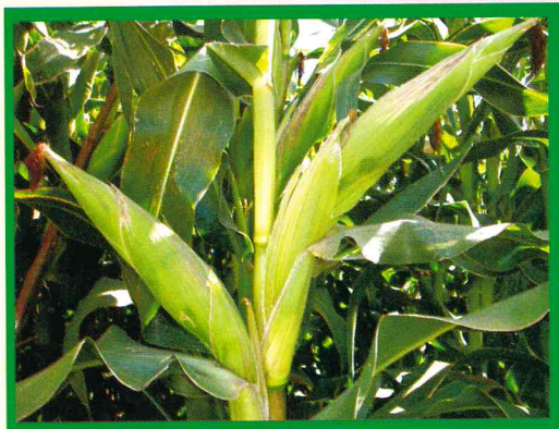
Maize KH 600 – 15A

As food prices continue to rise and farm inputs prices escalate, EASEED believes only the best varieties and good agricultural practices will help our farmers. As the demand for grain crops soars due to diversion to bio fuels, unpredictable weather patterns, rising populations and increased costs of production, farmers have an opportunity to get higher returns from Maize KH600-15A as was reported by most farmers in North Rift region.