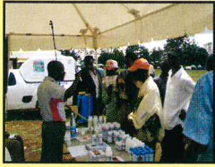
Farmers in Kerugoya attend Field day organized by Agriscope