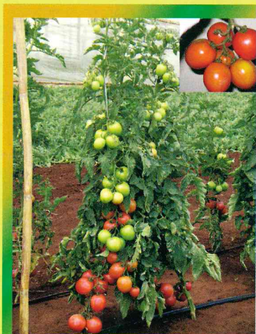
Tomato Bingwa F1

"Delivering advanced technologies to empower farmers"