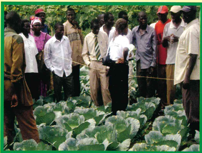
Farmers admire Cabbage Baraka F1 at a field day in Kyatiri- Masindi - Uganda

During a farmer's field day in Masindi District at Kyatiri, farmers had the following to say about EASEED products:-