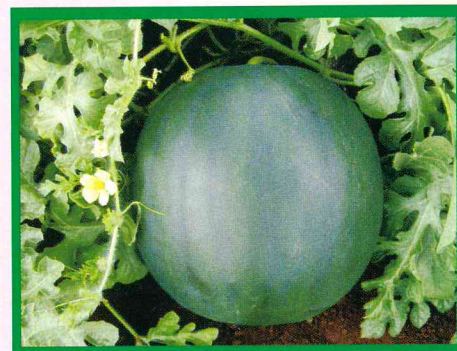
Watermelon Zuri F1