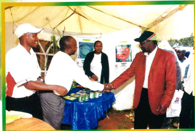
Minister for Agriculture Mr. William Ruto at EASEED stand during farmers field-day at Chepkoilel Campus (Moi University, Eldoret).