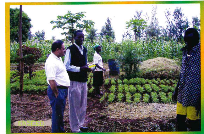
EASEED sponsored Nurseries – EASEED has partnered with Nursery Growers around the country to avail quality seeds to growers countrywide.