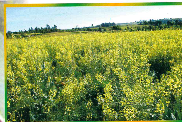
Collards production in Molo, Kenya.