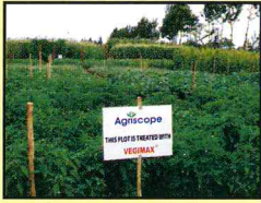
Vegimax treated plot at Thika farm