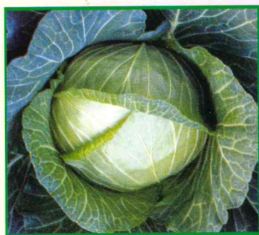
Cabbage Zawadi F1