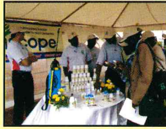
Agriscope products display stall at Thika TCM 2008