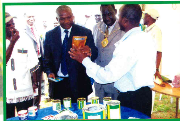
Assistant Minister for Trade Mr. Omingo Magara admires the new look hybrid packs for EASEED products at a farmers training session in Eldoret.