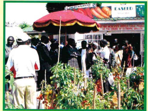
The Kabaka (sheltered by a red umbrella) being enlightened on the Africa's Best varieties at the Jinja Agricultural Show

His highness the Kabaka of Buganda, Ronald Muwenda Mutebi, was greatly impressed with the modern seed technology that was being demonstrated by EASEED and of particular importance our tomato varieties and the green house technology which guarantees high yields per unit area per season.