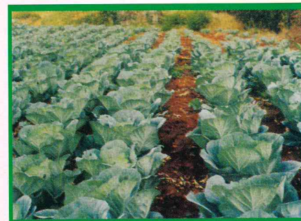
Cabbage Baraka F1

Despite the inadequate rains experienced in most parts of the country in 2008, Cabbage Baraka F1 out performed other varieties in terms of heat tolerance, field holding capacity and vigor in growth. Farmers in Karatina, Nyeri and Nyahururu have been very grateful to EASEED for introducing Baraka F1 as they are no longer worried about these issues as well as some common diseases like black rot, ring spots and cabbage yellows where Baraka F1 has exhibited exemplary performance. It is uniform in growth, compact and has excellent taste.