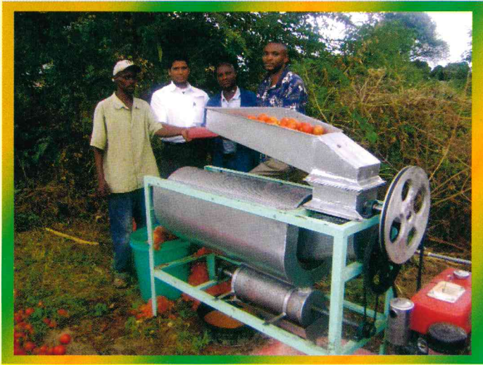
Farmers in Tanzania demonstrate how they process tomato Tengeru (from EASEED®).