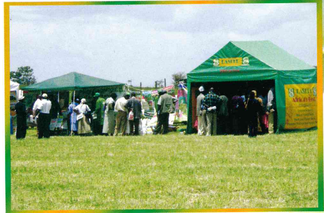
Farmers getting farming tips from EASEED Staff at Njoro field event.